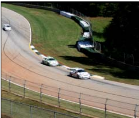
Chasing Down Pank

Smith looked to be back in the game before non-visible damage caused by the earlier spin resulted in a flat right rear tire. Smith again was able to drive the car back into the pits for a quick tire change enabling him to finish the race 18th in class.